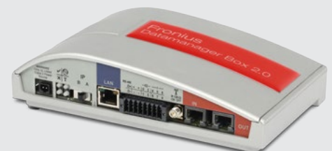
/ Fronius Datamanager Box 2.0